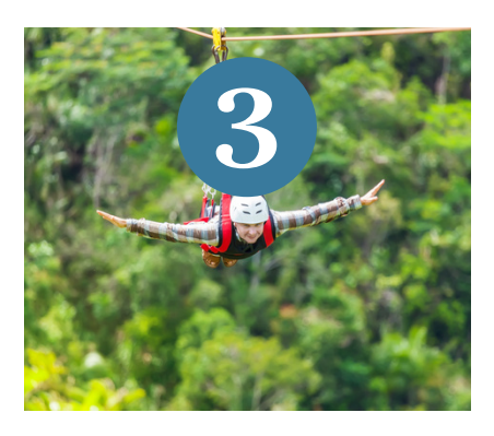
Just zippin' around

It's ok if your head is in the clouds as we explore this magnificent wonder.